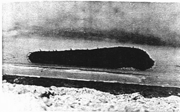
Fig. 1: Living specimen showing extended papillae, x1, no. H-45.